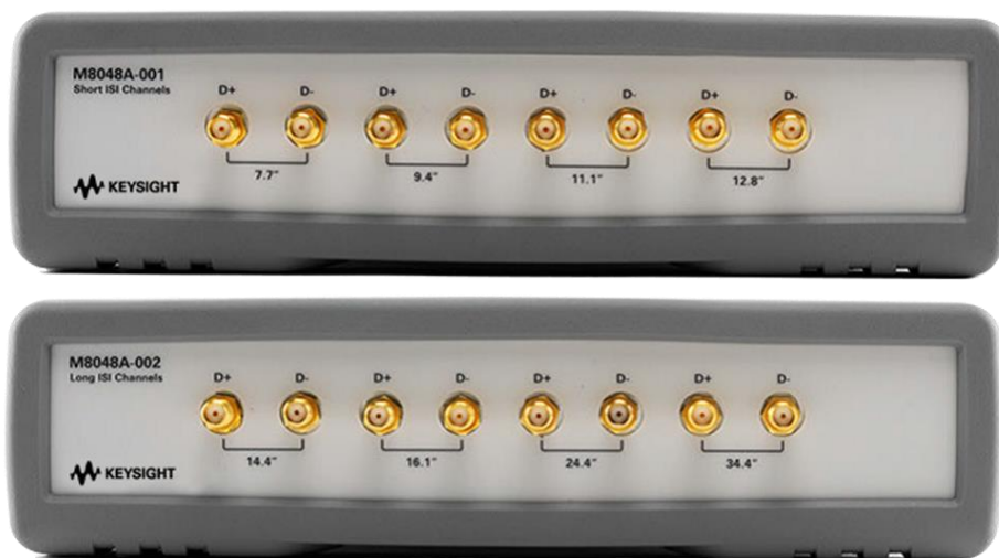
Figure 3: Front panel view of M8048A option 001 (top) and M8041A option 002 (bottom).