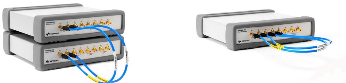
Figure 7: Short matched SMA cable pair for cascading ISI channels from two units or within one unit.