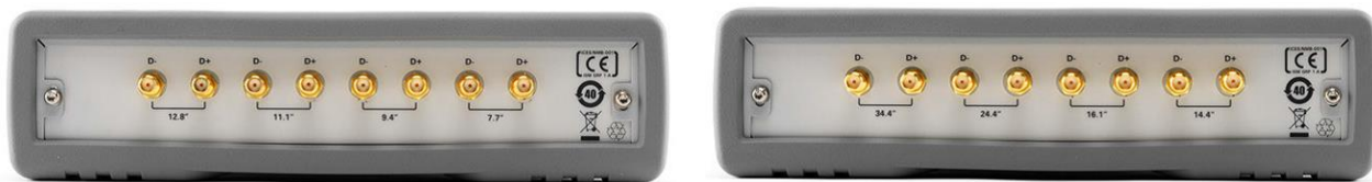
Figure 6: Rear panel view of M8048A-001 (left) and M8028A-002 (right).