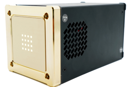
Figure 1. BBox One 5G 28 GHz