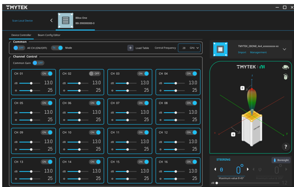
Figure 3. TMXLAB Kit – Software GUI for controlling BBox One

The BBox One software interface offers both UI and API control which are completely designed in house. Our patented software algorithm offers better accuracy and easier control on the beam angles. Both the UI and API are available for our customers to access and download from the link . The user interface shows the 16-channel phase and amplitude control block diagram as depicted below. To control the parameters, please drag the dB and \Phi slide bars on the desired channel to make the changes. The left portion of the interface shows the beam steering angle. This can be used together with our standard antenna kit to control the steering angle.